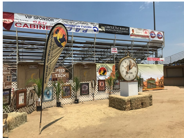
VIP / Sponsor Area

For more sponsorship information or if you have questions or comments, please call the Lakeside Optimist Bulls Only Rodeo Hotline Phone number: 619-443-2447 or email: info@bullsonlyrodeo.com .